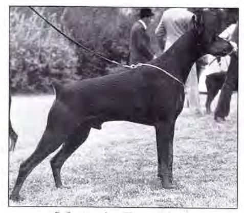
Reference sire: Ch. and Sieger Don Dayan v. Franckenhorst, SchH1 (Bryan v. Forell x Olive of Bamby's Pride) The grandsire of Quirinus on the sire side.