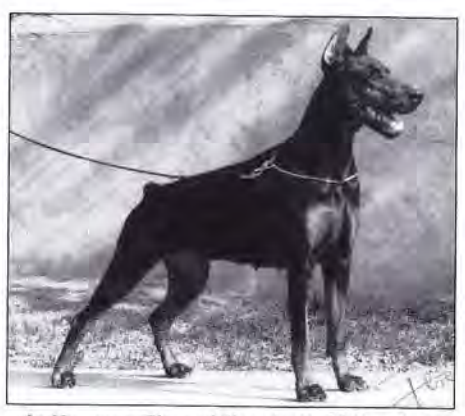
In Hungary: Ch. and Siegerin Gold-Drachen Comtesse Charmaine (Quirinus x Arany-Sárkány Regi). She has her sire's father-typical expression.