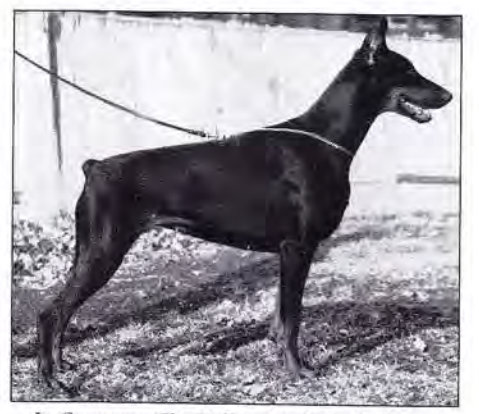
In Germany: Ch. Hellena v. Brandenburg, SchH1 (Quirinus x Harina v. Brandenburg)

Conformation wise Quirinus was a tall, strong boned, deep bodied, masculine male with clean, rich markings that tended to oversize on the chest. His underchest was well formed and long, but lacked sufficient tuck up. His shoulder was sufficiently well laid, although the upper