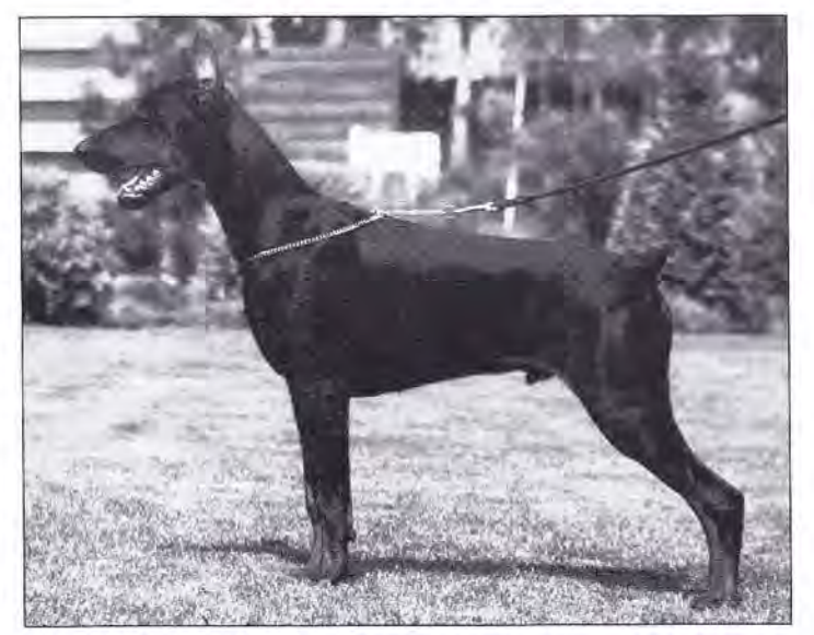
In Indonesia: Ch. Atilla v.d. Piratenburg (Quirinus x Kastra v. Norden Stamm) Photo at 6 months.

Fanthomas's national and international champion children are quiet achievers; some other examples are the Belgium Champion Primo Pride van't Sabbatsveld (x Leona v. Raubenstein), and the Dutch Winner Riguel van't Rujanuda's Hof /1993 (x Najib van't Rujanuda's Hof) and sibling to Roanka , the multi-Champions Szultan and Sayonara van't Sabbatsveld (x Orana van't Sabbatsveld), the Belgium and International Champion Swift v. Fuchsfelderhof (x Nardia van't Hof Ter Eeckhoot) and the