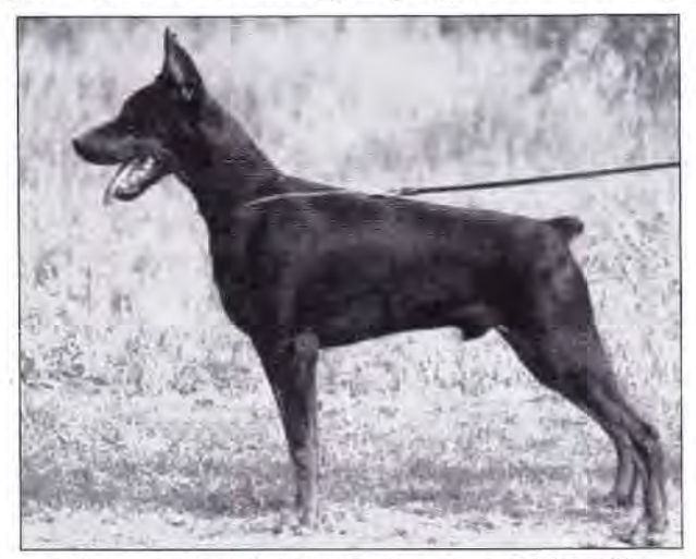
In Hungary: Ch. and multi-BIS winner Arany-Sárkány Togo (Quirinus x Arany-Sárkány Romy) A look highly typical of his sire line. Photo at 7 months.

Fanthomas seems more suited in the role of bitch producer, with excellent daughters like Champion Lambada Brandenburg/1993 (x Athene v. V. Brandenburg) a BOB and Reserve-Junior DV Siegerin and 1994 Golden Bear winner, and Landesssiegerin Orshira v. Brandenburg/1993 (x Tiffeny v. Norden Stamm), Gitana v. Castell/1994 (x Nena v. Castell) and the Dutch Champion Roanka van't Rujanuda's Hof/1993 (x Najib van't Rudjanuda's Hof) to his credit. Although handsome sons like Quarlos v. Roveline/1992 (x Lema v. Roveline) and Lord Lauder v. Heckendorf (x Hannah-Happy v. Heckendorf) have shown this is not necessarily the rule, despite Quarlos's disturbing dog aggression limiting his