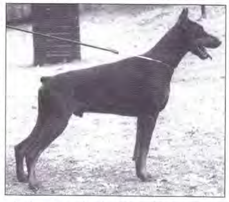
In Germany: Ch. Magister v. Brandenburg, SchH1 (Quirinus x Tiffeny v. Norden Stamm)

Atilla is also fortunate to have a strong mother line to support his blood. His Angekört dam Kastra v. Norden Stamm/1985 (Ebo v.d. Groote Maat x Alida v. Flandrischen Löwen) was a full sister to Kalina and known for her fiery combative instinct (Landesgruppe Nord Leistungssieger/State Working Champion in 1990). Kastra and her daughters Reni v. Norden Stamm, Chessy v. Falltor/1988 (by Nicolai v. Klosterkamp) and Atlanta v.d. Piratenburg/1990 (by Quirinus) all proved to be a reliable producers of numerous Champion, Sieger and Angekört progeny. Atilla was sold from Thailand to Indonesia at 7 years of age for a reported $20,000, and went on to win the Indonesian National Specialty Show in 1995.