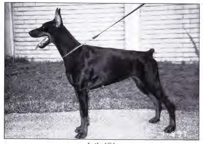
In the USA: More mother-typical is Nemesis Gilli , a full sister to Gadis. Best Puppy at the 1994 UDC National.

arm should have been longer and much better angulated. The rear was well angulated, broad and muscular. The harmony between his prominent depth of chest and well formed forechest were amongst his best features and he