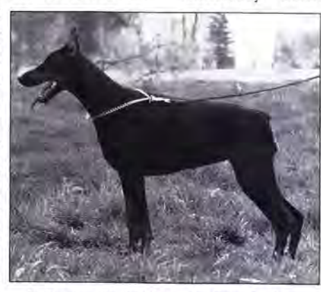
In Russia: Ch. Madonna v. Brandenburg (Quirinus x Tiffeny v. Norden Stamm)