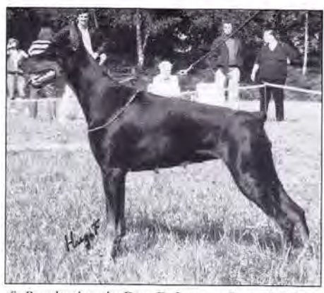
Ch. & Bundessiegerin Dea Delores v. Franckenhorst, IPO2 (Arrow v. Harro's berg x Vivre Vivean v. Franckenhorst) The mother of Quirinus. Ch. and Sieger Don Dayan v. Franckenhorst, SchH1 (Bryan v. Forell x Olive of Bamby's Pride). The grandsire of Quirinus on the sire side.