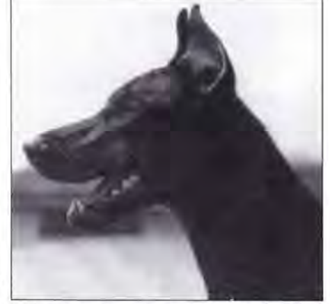
In Latvia: This father-typical head study of the Irinus son Ch. Radz Elsan Haus Imidz (x Elis-Aski) demonstrates a shorter, broader head type whose blockier look is typical of the Alpha -Quirinus - (and partially Irinus) legacy.

Bundessieger Rembrandt v. Norden Stamm and has produced an impressive array of Sieger, Specialty Winner, Champion and Angekört progeny in her