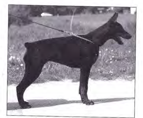
In Germany: A Quirinus granddaughter Ch. Lambada v. Brandenburg, SchH1 (Judifax Fanthomas x Athene v. Brandenburg) Photo at 7 months.