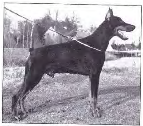
In Belgium: Ch. Judifax Fanthomas, SchH3 (Quirinus x Judifax Djaib)