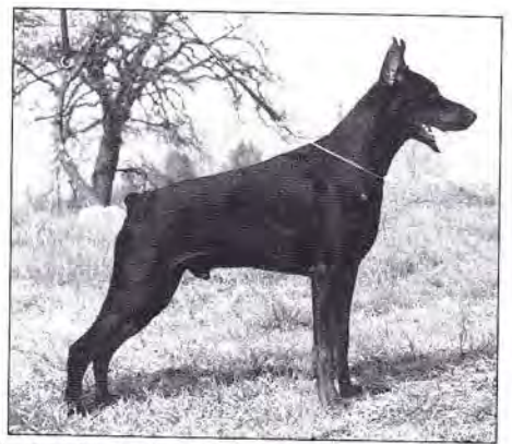
In Germany: Quirina v. Brandenburg Ch. and Siegerin Ajoko Quirono di Matario, (Quirinus x Tiffeny v. Norden Stamm)