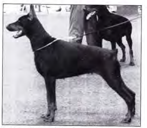
In Holland: Ch. and Siegerin Nemesis Gadis, IPO1 (Quirinus x Nicole v. Norden Stamm) The short neck set into a deep, excellently proportioned body are father-typical hallmarks.