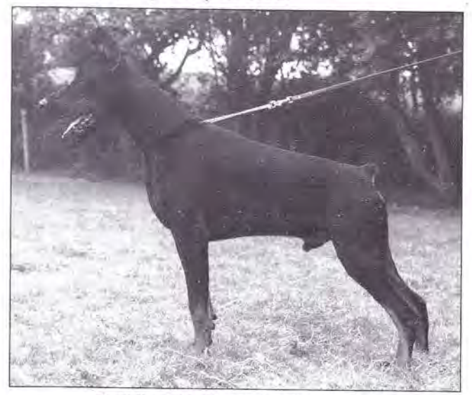
In Holland: Ch. Jivago v.h. Wantij, IPO1 (Quirinus x Lara v. h. Wantij) A dog absolutely Alpha-typical in type, head and expression.

Bundessiegerin in 1994, Dutch Winner in 1994, Dutch Specialty Bitch in 1995, Europasiegerin in 1995 and Best of Breed at the Dutch Specialty in 1996.