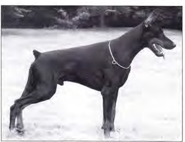
In Russia: Ch. Irinus de Ferignis, SchH3 (Quirinus x Alina v't gröne Land)

Togo was a Best In Group and Best In Show winner and the two brothers represent an incest breeding on Hertog Alpha v. Le Dobry (2:2). Both dogs have won and produced exceptionally well. Another champion in Hungary is Tahi-Réme Wally /1995 (Quirinus x Tahi-Rémi Líz). She was the 1996 Junior IDC