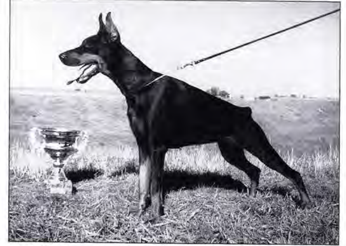
In Hungary: Ch. Tahi-Réme Wally (Quirinus x Tahi-Réme Liz) UDC Focus

animal that consistently stamped his offspring with his own unmistakable hallmarks; a strong boned, deep bodied, harmonious structure with well sprung ribs and plenty of volume, bone and natural substance typical of the Chico line. His strong head (some even with the slight Roman "Chico" nose) and the short neck is also typical of many Chico descendants. And Quirinus kids are always