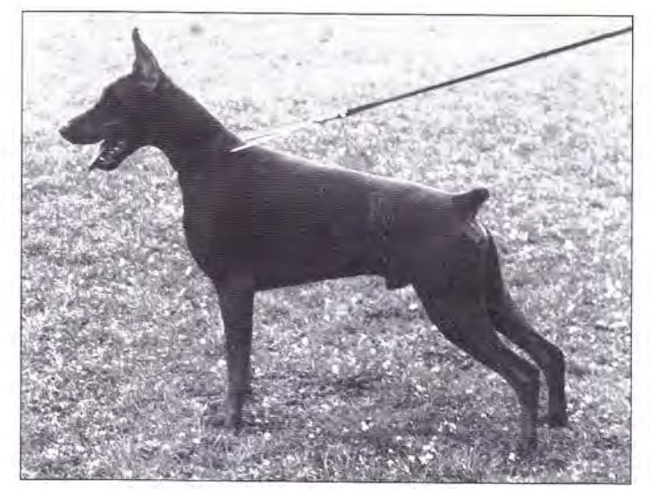
In the USA: Ch. Cara's Skeeter, SchH1 in stance.

few litters. Her most recently successful progeny being Margitta v. Märchengarten /1995 (sired by Saron v. Nymphenburg de Grifeu). Margitta was the 1997 Specialty Winner (CAC) in Moscow. Reni was an inbreeding on the